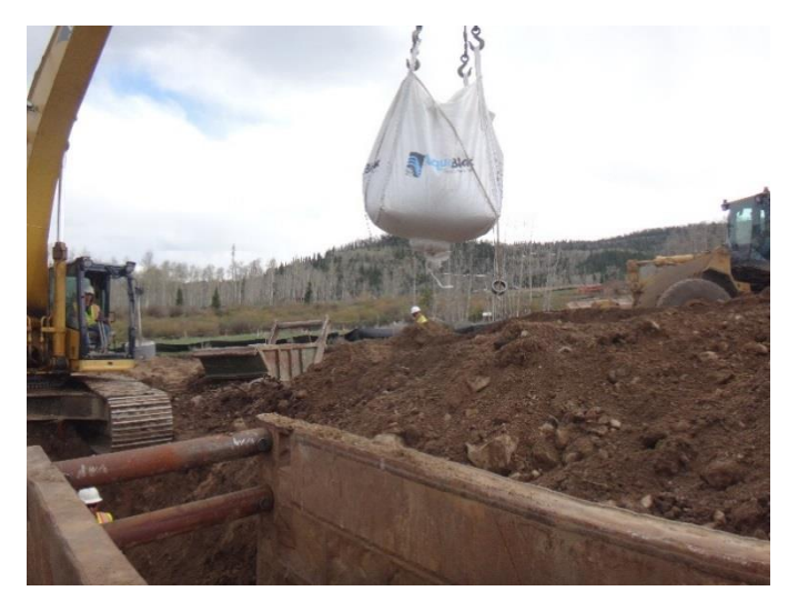
Photo 4. The excavator bringing over a bulk bag (standard shipping unit for bulk material) to the trench to be placed into the trench dam form.