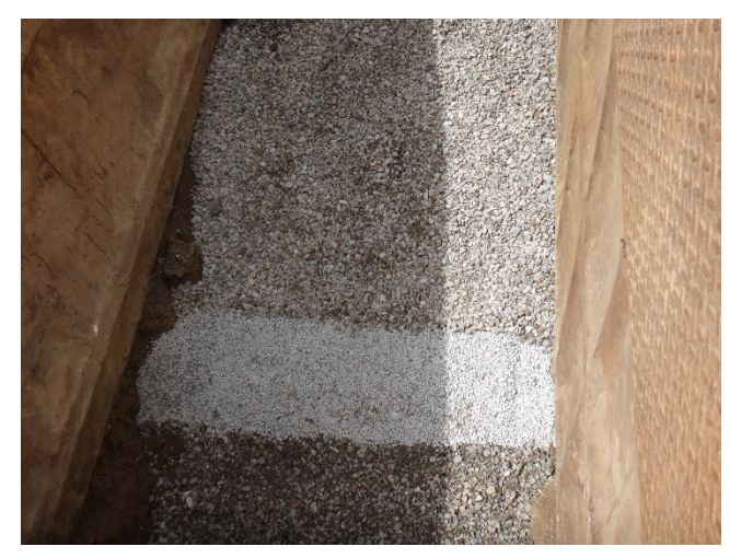
Photo 6. Construction completed after removal of the trench dam form.

Results: Using AquaBlok, the trench dams have shown no signs of failure. The dams are functioning as designed.