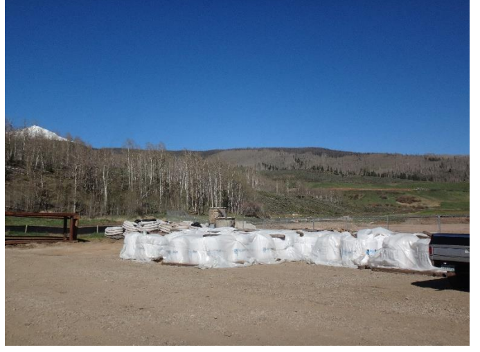
Photo 2. Storage of the AquaBlok material on site. Tarped and protected from the elements.