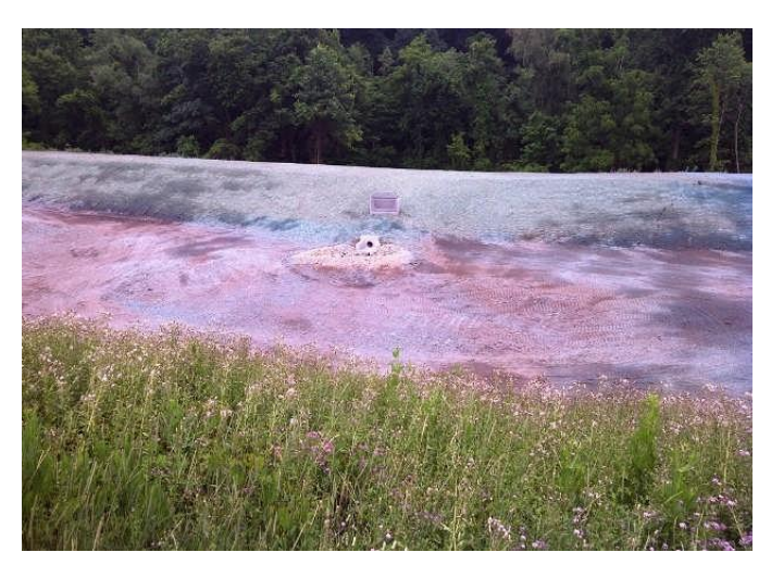
Photo 7. Berm reconstruction completed (basin in foreground) - note riser structure in center of photo