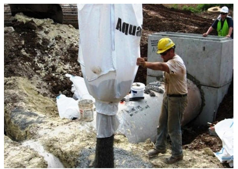
Photo 1. AquaBlok placement from a bulk bag (standard shipping unit for bulk material) using a track loader/excavator – note discharge snout directing product into trench cut perpendicular to the overflow discharge pipe