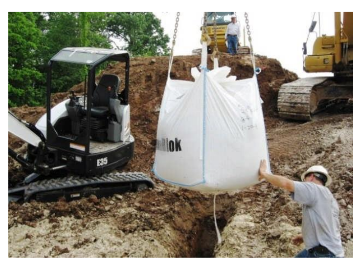
Photo 2. Excavation of the perpendicular anti-seep trench (~12" width) that ultimately received AquaBlok from atop the existing berm (basin to the left)

Results: Using a combination of traditional methods (compacted clay) and new technology (AquaBlok), the outfall reconstruction has remained stable through multiple significant storm events and shows no signs of the types of degradation that lead to its predecessor's failure. The basin is functioning as designed.