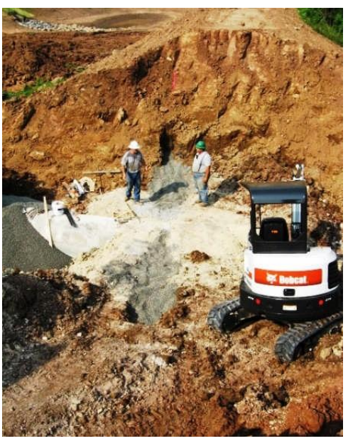
Photo 5. AquaBlok filled anti-seep trench from atop existing berm (lift one of three, ~6 vertical feet of the ~18 vertical feet total