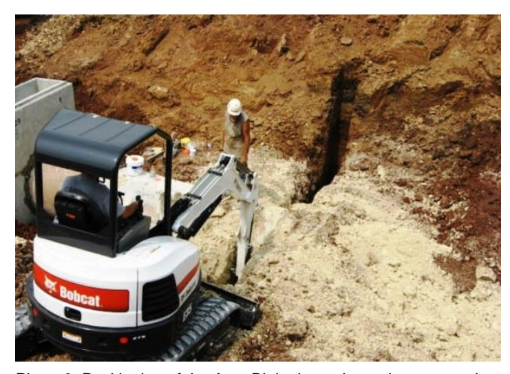
Photo 3. Positioning of the AquaBlok above the anti-seep trench (basin to the right)